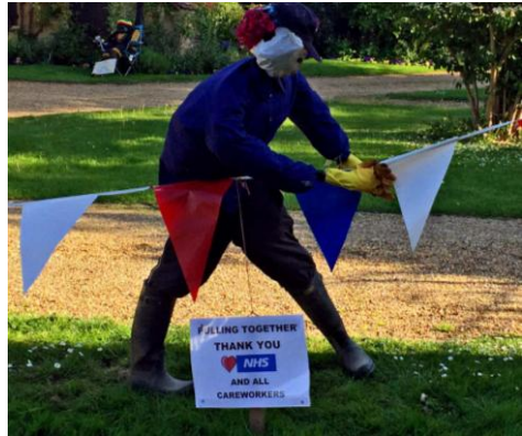
... support for key workers everywhere ...