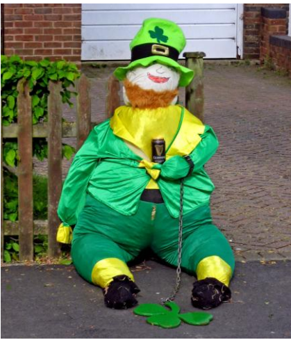
...while others never tried.