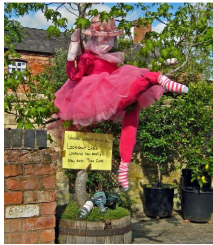
There were high jinks in Friday Street ...