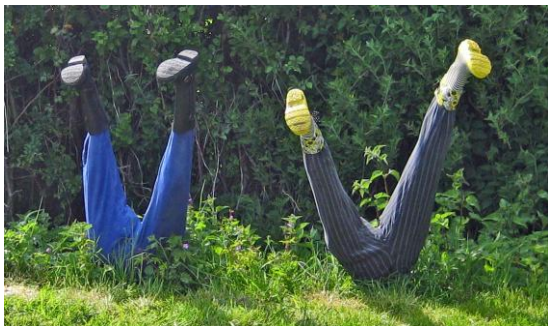
... but some did not make it up the hill ...