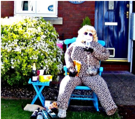
...partying in Back Lane and