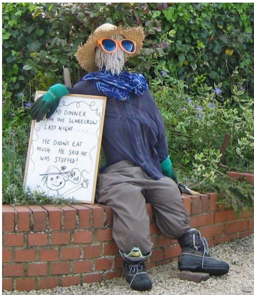
The first to arrive was on Hill Lane, in Upper Quinton ... others soon followed